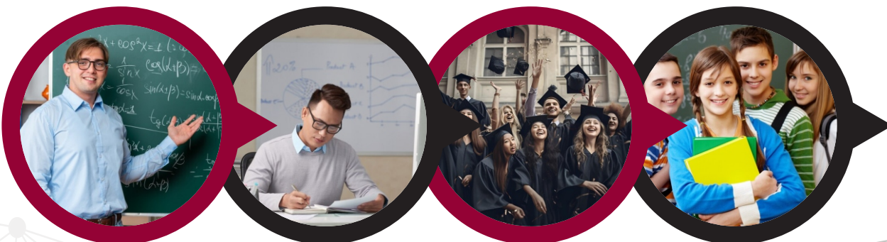
Teachers (Mathematics, Science, English, etc.) | Academic Administrators