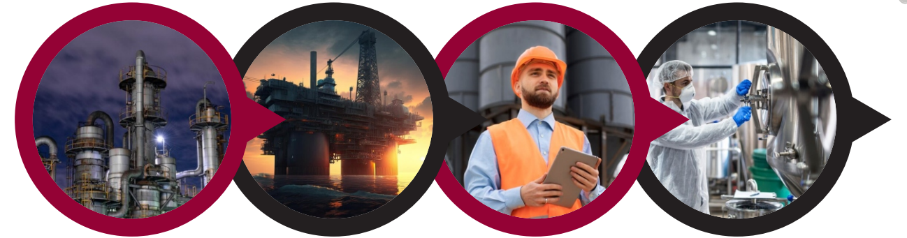
Engineers (Petroleum, Chemical, Mechanical) | Technicians | Drillers