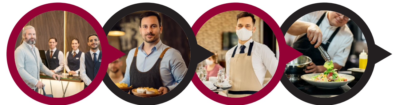
Hotel and Restaurant Staff | Tour Guides | Hospitality Management