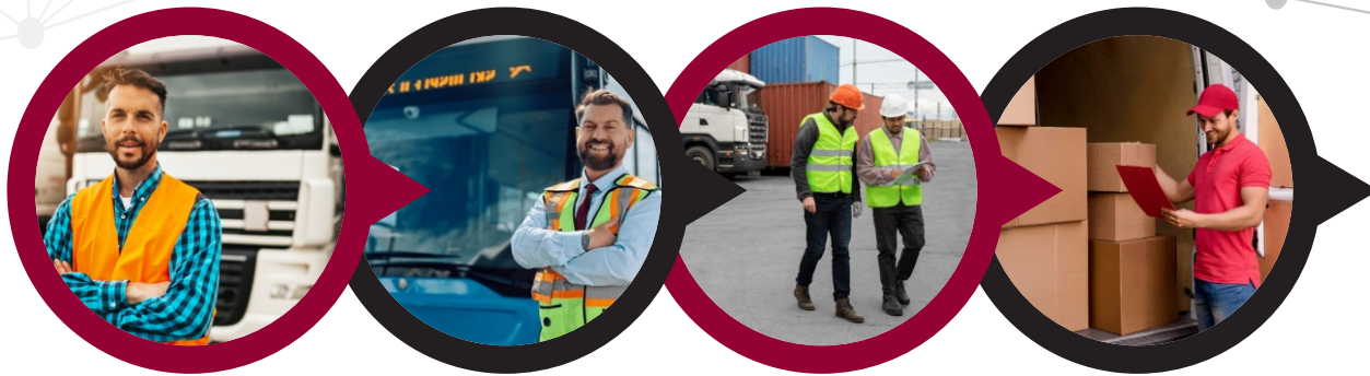
Truck Drivers | Bus Driver | Logistics Coordinators | Shipping and Receiving Personnel