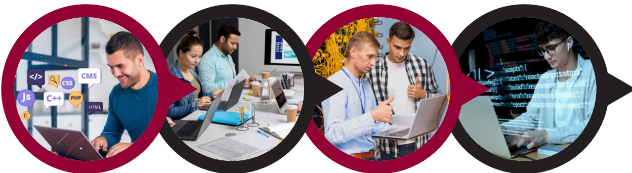
Software Developers | IT Professionals | System Administrators