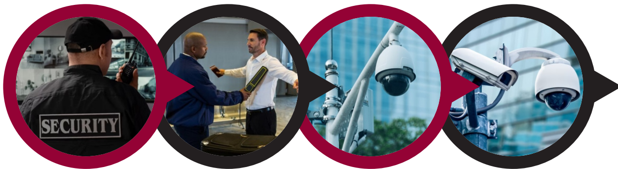
CCTV Technician | Security Guards | Surveillance Personnel