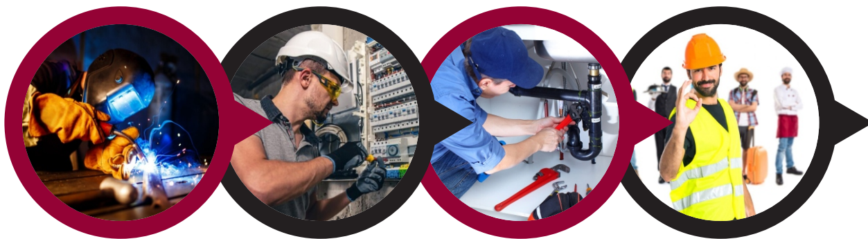
Carpenter | Welders | Electricians | Plumbers | General Laborers