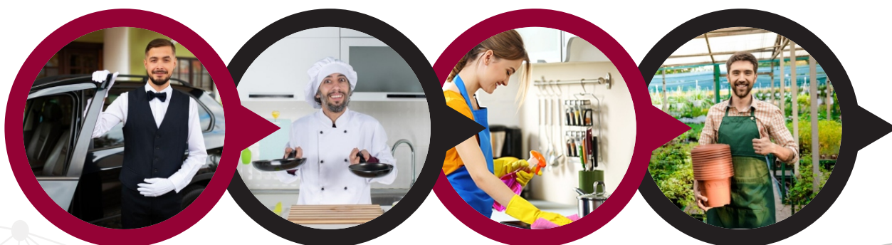
House Driver | House Cook | Housemaids | House Worker