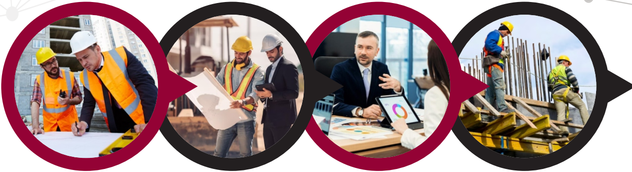
Civil Engineers | Architects | Project Managers | Construction Workers