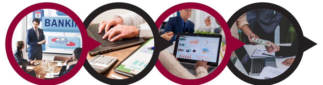
Accountants | Financial Analysts | Banking Professionals