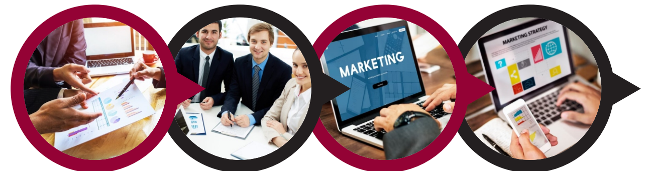
Sales Executives | Marketing Professionals