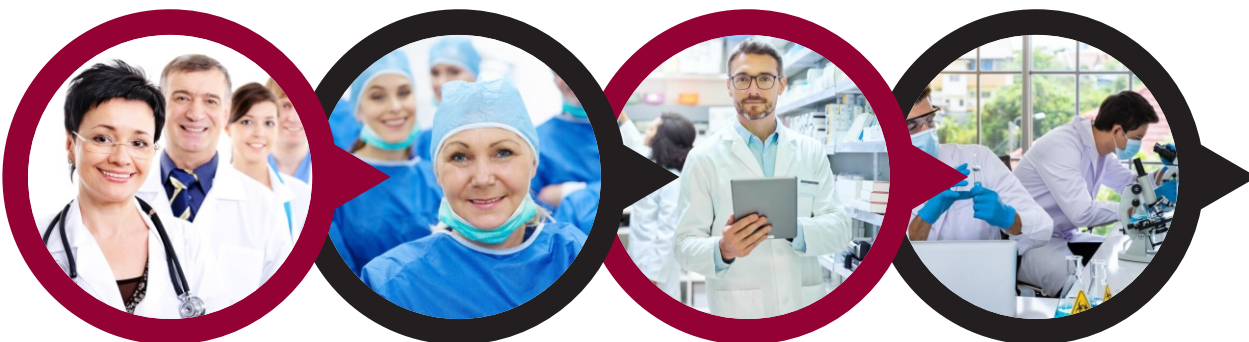
Doctors | Nurses | Pharmacists | Lab Technicians